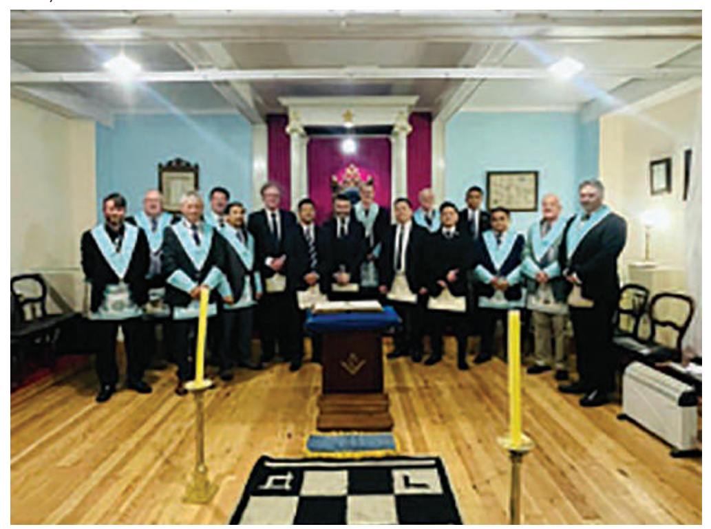
(Eighteen brethren, all from Neptune Lodge 190, at the emergency meeting for the purpose of initiating two Entered Apprentices, in March 2023, at Kings Terrace, Cóbh).

Neptune are greatly appreciative of all the support and well wishes received from the brethren of the province and look forward to seeing you at our next meeting.