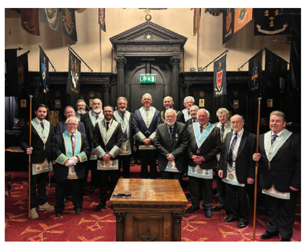
Some members and guests of St. Fin Barre's Lodge No.8, Cork. Photo following the Installation Meeting in 2023 The newly installed WM in the centre with the PGM to his left.

We hold our meetings at 27, Tuckey Street, Cork on the First Thursday of every month, at 8.00 pm (excluding June, July, and August). February meeting on First Saturday at 6.00 pm (Installation Dinner).