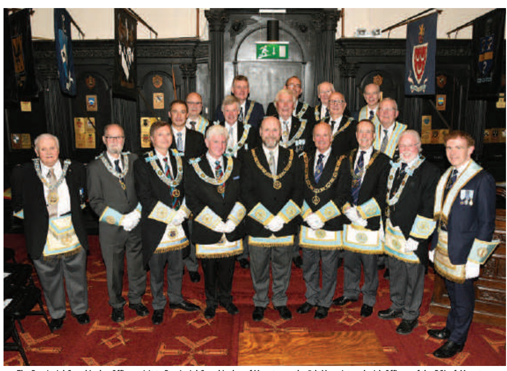
The Provincial Grand Lodge Officers visit to Provincial Grand Lodge of Munster on the 5th May pictured with Officers of the PGL of Munster.