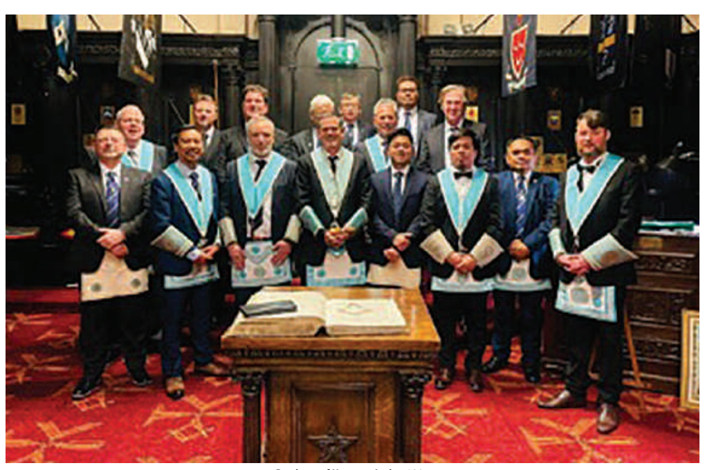
Brethren of Neptune Lodge 190.