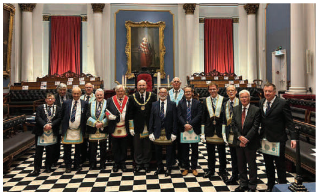
Large Munster group who attended Grand Lodge recently.