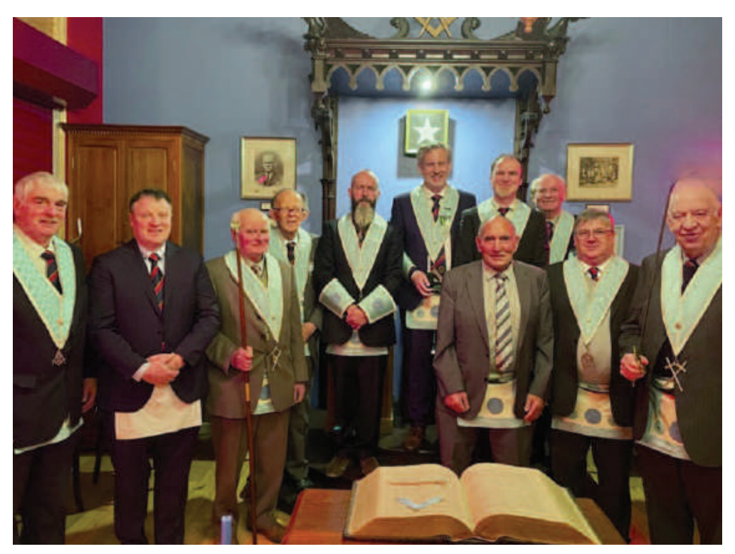
The Brethren of Lodge 84