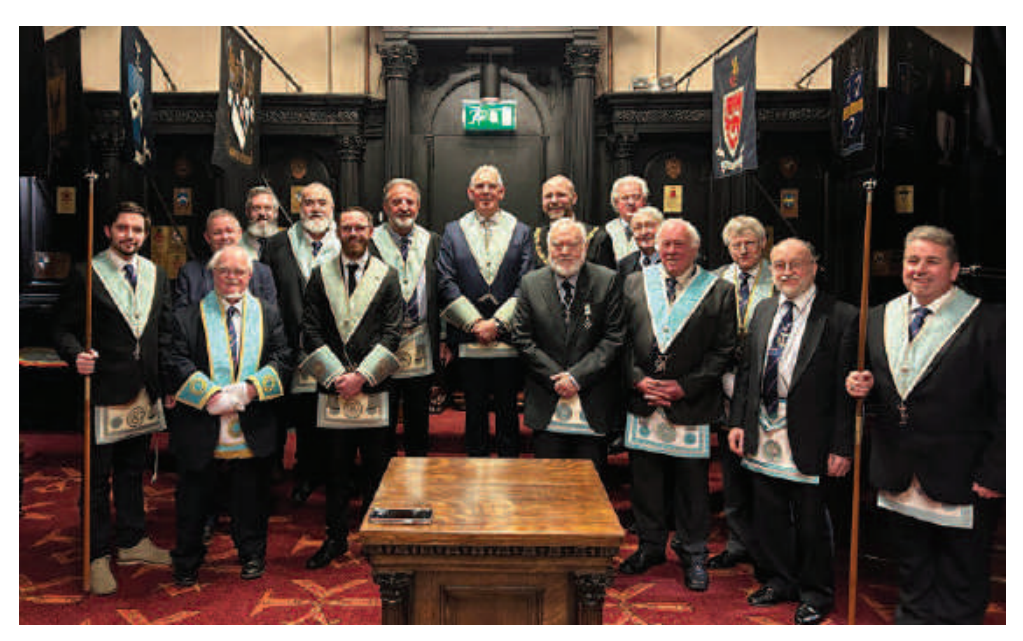
St Fin Barre's Lodge No. 8